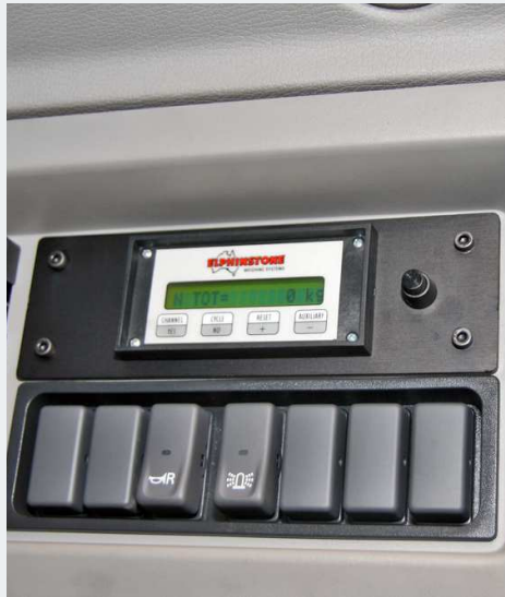
Cab mounted display