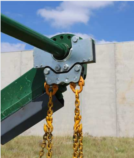
Extremely rugged design for heavy duty application

Wireless Weighing System is unique in its design with a truly wireless loadcell.